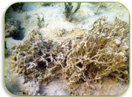
A loggerhead sponge after a die-off.