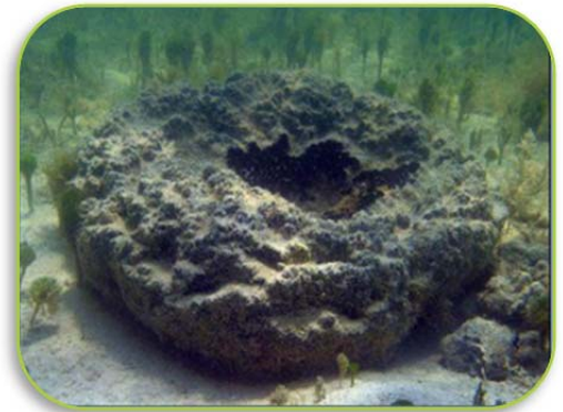
A healthy loggerhead sponge.

Because of their abundance and size, sponges play an important part in naturally functioning ecosystems. As the dominant filter feeding organism in these habitats, they play a critical role in cycling food resources. They also alter water chemistry by cycling nutrients, and provide essential nursery habitat for important commercial fishery species like spiny lobsters and stone crabs.