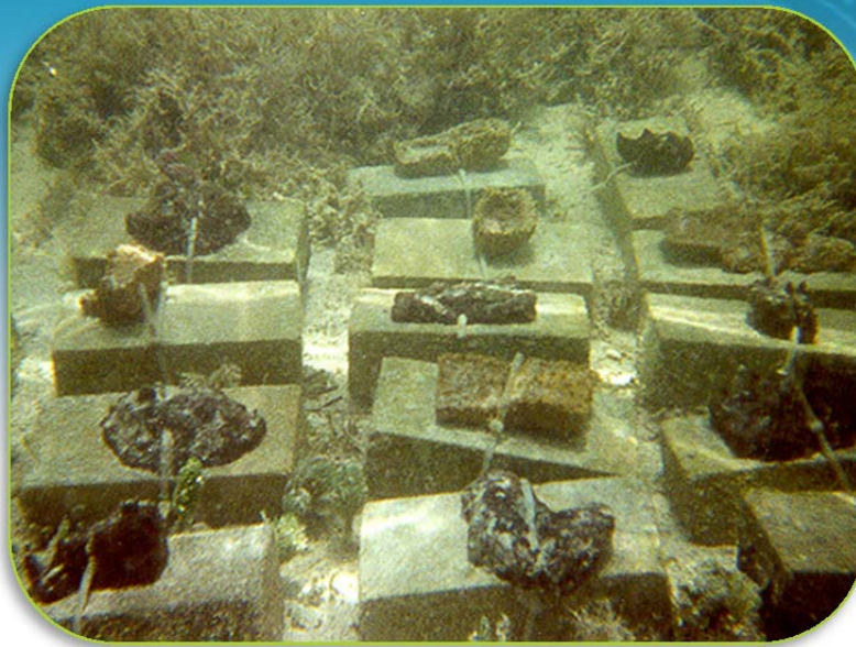
At left, preparing sponge transplants. At right, sponge cuttings healing before transplantation. Below, a healthy vase sponge.

Sponges are animals that are among the most visible residents of the hard-bottom habitats typical of the Florida Keys and Florida Bay. Some sponge species, like the vase and loggerhead, can grow to over 1 meter in diameter and live for decades if not longer.